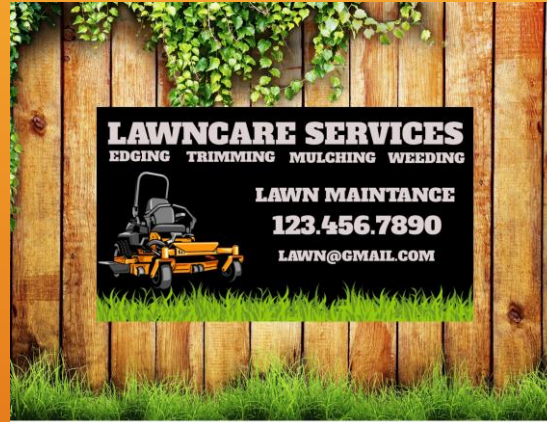
Start Your Own Business