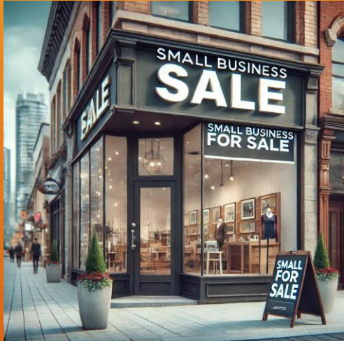
Buy an Existing Business